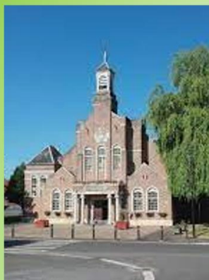
Keighley Hall at Poix Du Nord

Offer - It is the last full week of the year so this week is suggestions for things to do during the holiday.