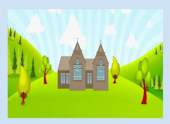
Laycock Primary School

The students attended a wide range of placements and benefited from being out at work learning new skills.