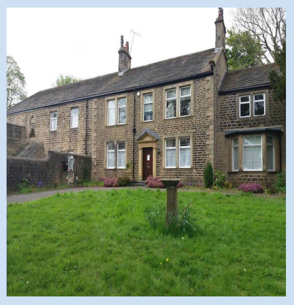
The Good Shepherd Centre

The students enjoyed their work experience and the experience has helped them decide what they want to do when they leave school and what paths to take.