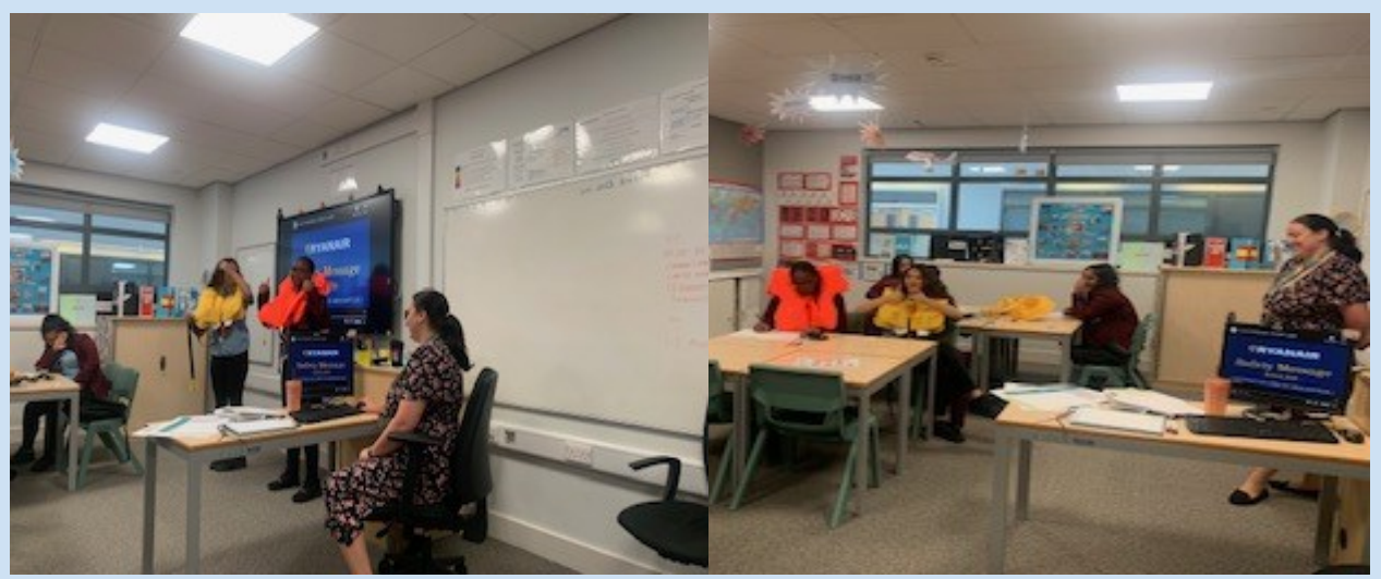
Trying on life saving jackets in Travel and Tourism lesson.

Year 9 students enjoyed a Taster Day at Keighley College. They were able to look round the college and experience some of the courses they have to offer like Joinery, Childcare, Travel and Tourism, Health Courses, Public Services and many more.